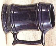
M2 - 18oz. Stein