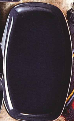
5QS - Nacho Platter