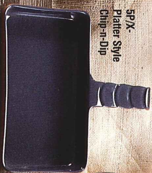
5P/X - Platter Style Chip-n-Dip